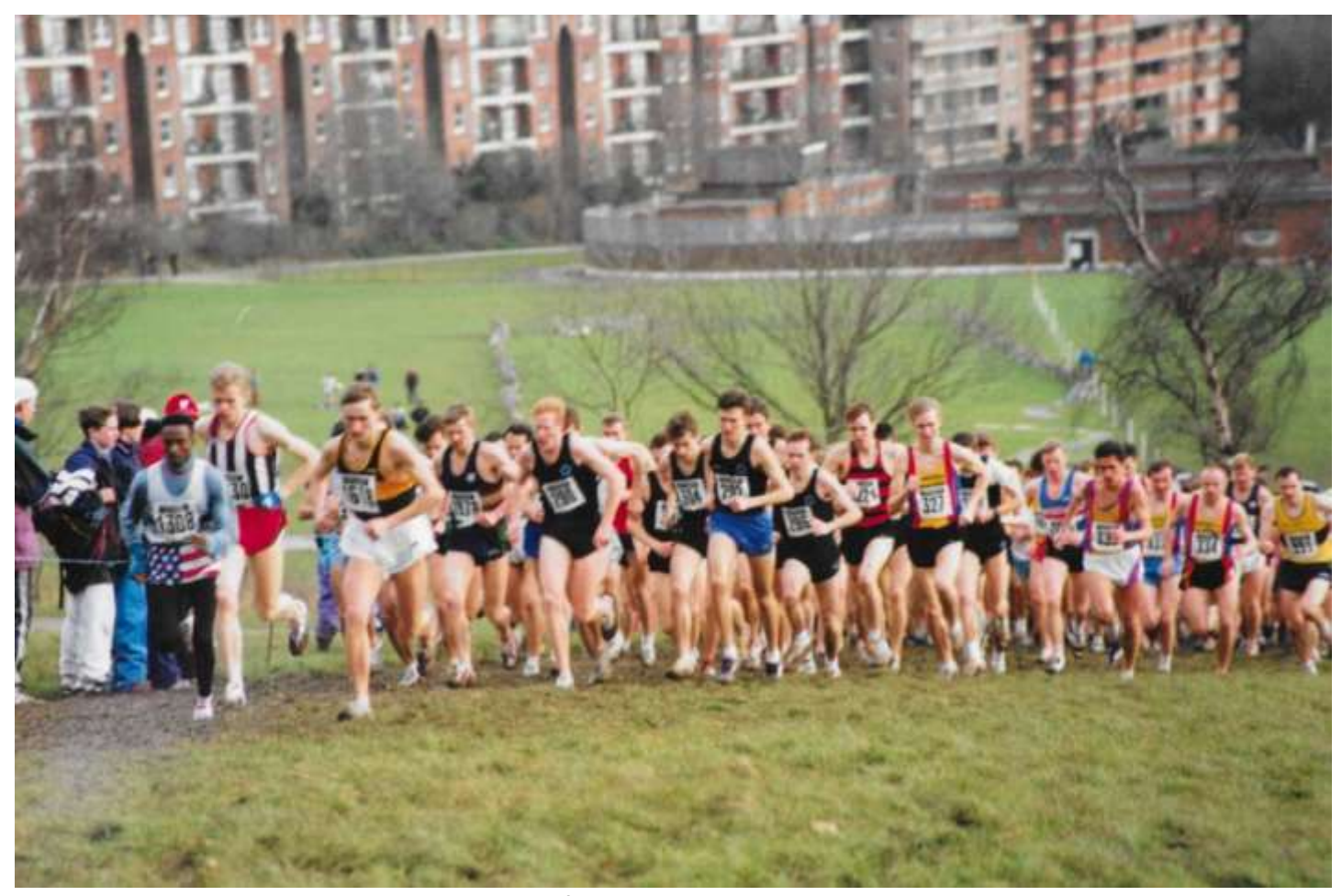
Start of the Southern Mens race 1995