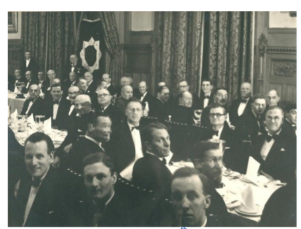
Members Dining Room 6<sup>th</sup> February 1959

You are invited to reserve your place at our 150<sup>th</sup> Anniversary Dinner in this historic setting simply by paying a deposit £20, non-returnable but set against the full ticket price £100. Members will have priority until 30 June 2019, former members, partners and other guests will be placed on a waiting list. Places will be allocated in July and the balance due will be payable by 31 August 2019 after which formal invitations will be issued.