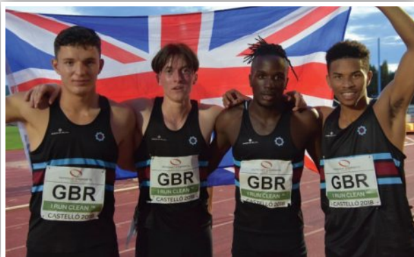
The 4x4 team's time of 4.17 was the fastest by a B&B junior squad for 20 years

The second match was on our home turf and not surprisingly produced one of our most dominant performances of the summer. The total score of 869 was a league record, overtaking the record we had set in the same fixture the year before. Spurred on by home support, the junior