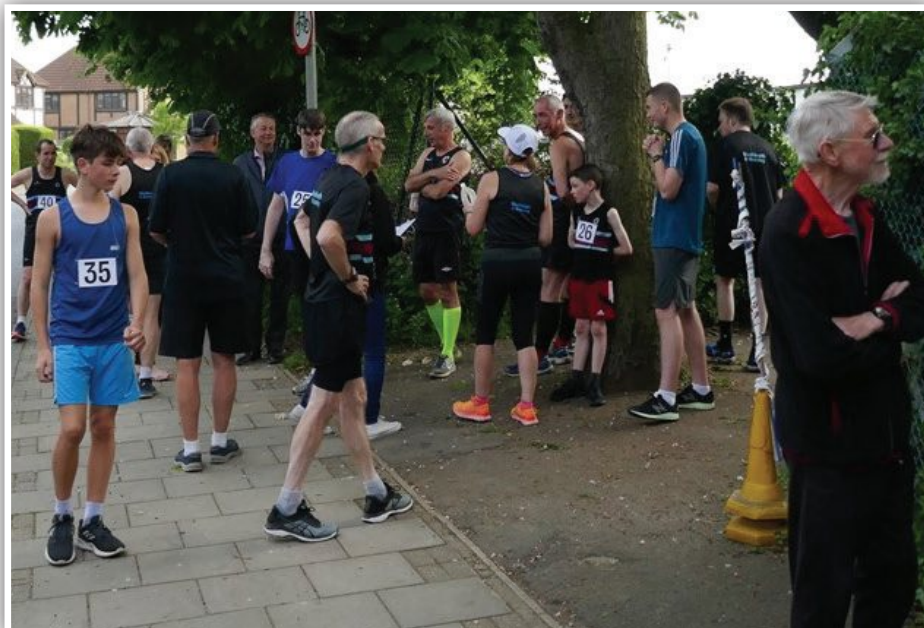
Runners waiting nervously before the start of a race in Teiwegs Lane.