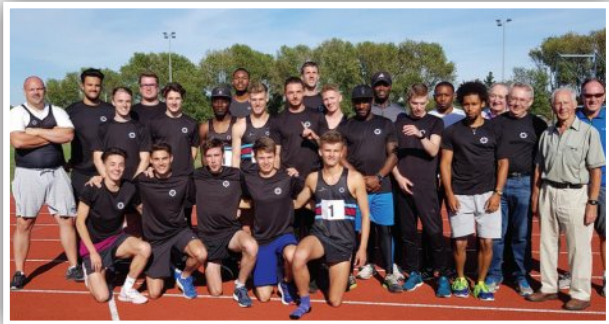
Promoted to the Premier Division of the British Athletic League