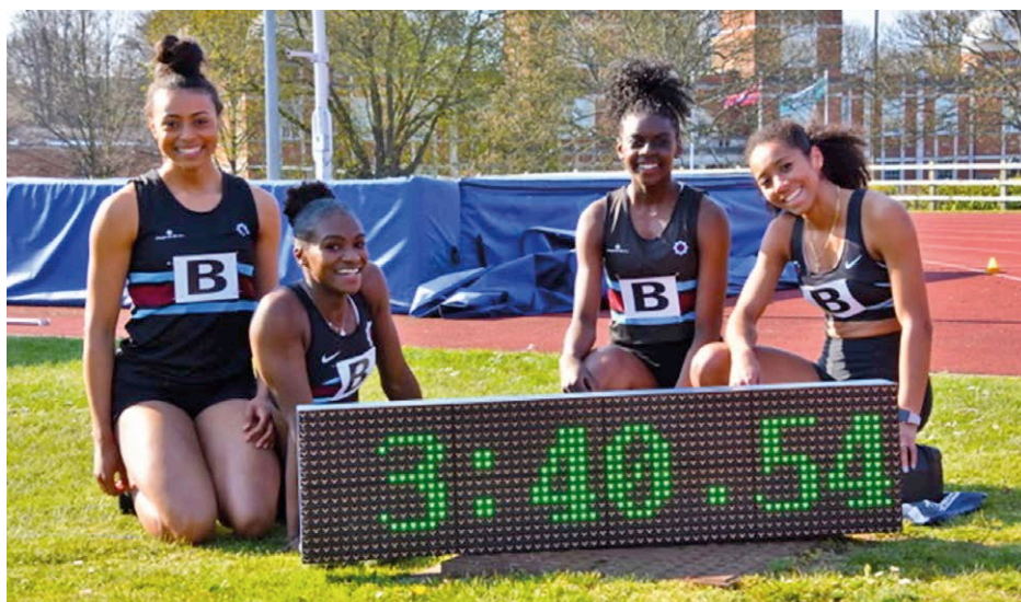
The Women's 4x400 team... performed to the largest crowd ever for the SAL

However we dominated on the track and had several strong performances in the field resulting in us winning the match from host club Medway & Maidstone by a convincing 27.5 points. We ran a swift 3:20.83 in the men's 4x400m and then had the pleasure of watching an