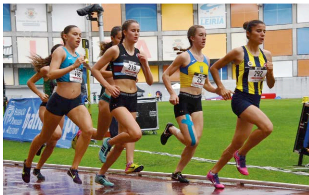
Heavy rain created abysmal conditions