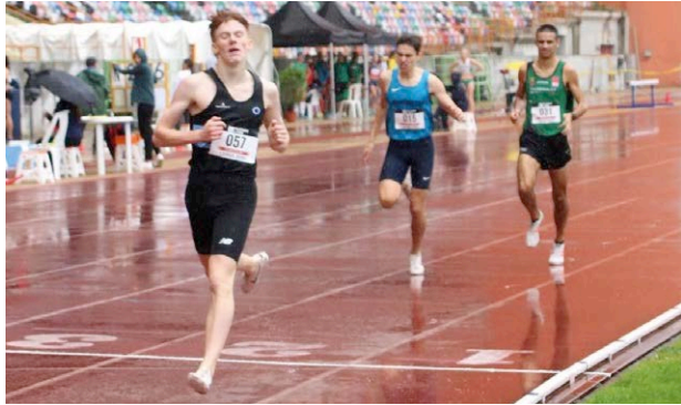
One of the 'few' in rain soaked Leiria

Back to the 2019 season and the stage was set for the final fixture of the year, the