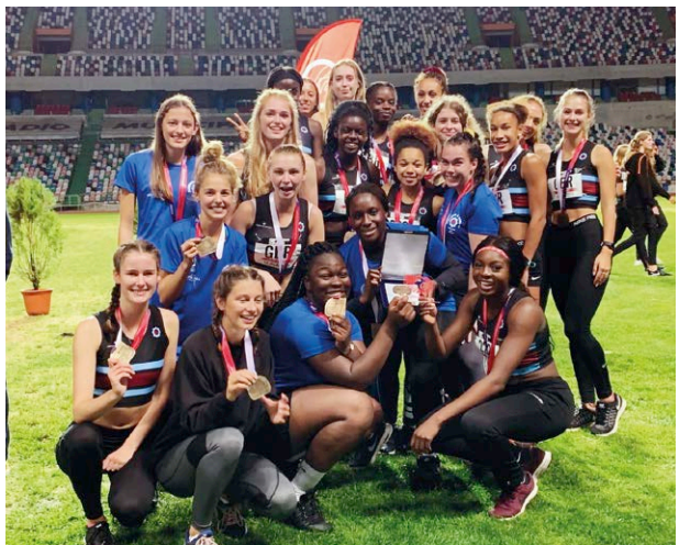
The Junior Ladies team won third place in a rain soaked final in Leiria

Friday morning was, as the brochures often say, 'at leisure'. Many took the opportunity of exploring what has become one of the most important international destinations for religious tourism, receiving between 6 and 8 million pilgrims a year, following the apparitions of the Virgin Mary reported