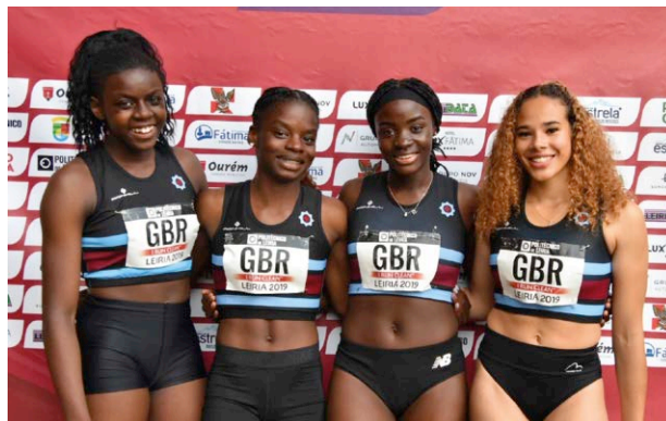
The 4x400m relay team gave Fenerbahçe a run for their money