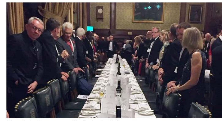
Grace having been pronounced in the simplest fashion