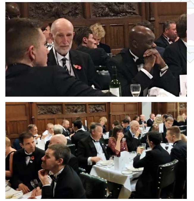
Members and guests at the dining tables