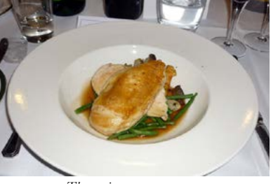
The main course

The tables had been laid out in the manner of top class restaurants with the usual pristine white tablecloths and napkins but not too many pieces of cutlery as there were only three courses at this meal. A top table along most of the Thames-side was designated the President's table as it is in most club dinners, and surrounding it were thirteen smaller