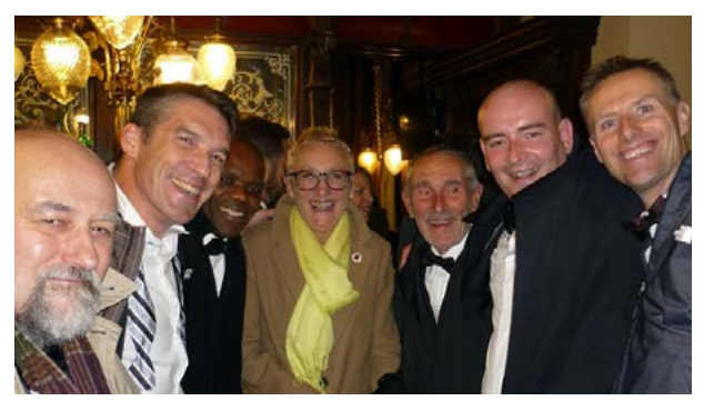
after the dinner.... Drinks at the St Stephen's tavern to reflect on the evening and perform the club cry

Finally, as the time approached, it was possible to move down to the dining room suite and members and guests were shown in and, ascertaining their places in the seating plan provided, processed into the Strangers' Dining Room and the lovely adjoining Pugin Room for the drinks reception. This entitled everyone to a free drink (prosecco, beer or a soft drink) and access to a makeshift bar for any further( if rather pricy) drinks. At this point perhaps in order to appreciate the value of the occasion against its price, one