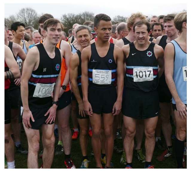
Blackheath runners lining up at the least muddy part of the Nationals course

Sadly it was 1 short of a full 12 for the 2nd year in a row, but you can't have everything.