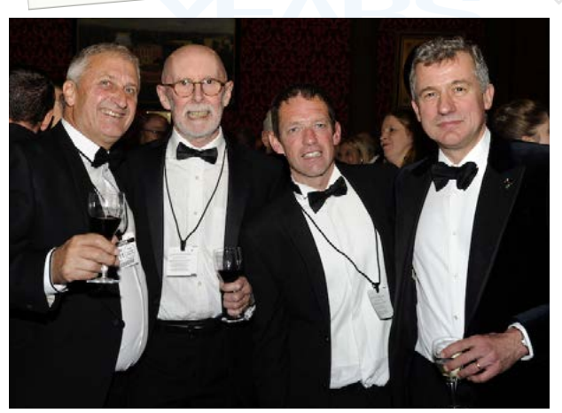
Some Wednesday Nighters in evening attire