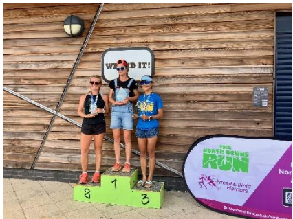
Park Run 28 June 2025

Saturday saw 71 members run at 29 different events.