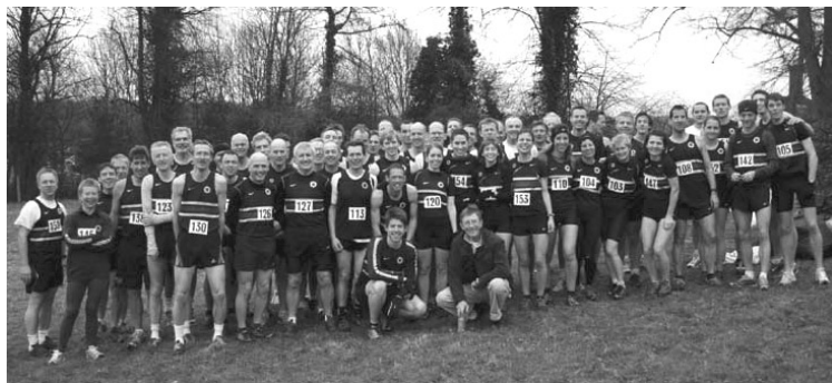
Prior to the start of the SLH Mob Match on 8 March 2008 – a good turn out and we WON! We need to keep this winning streak going... Please try and turn out this year. After 97 events the score is SLH 51 wins and Blackheath 46.