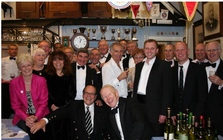
Social functions take place at the Clubhouse throughout the year. This is the 'under the clock at one o'clock' photo from the Annual Dinner last year.