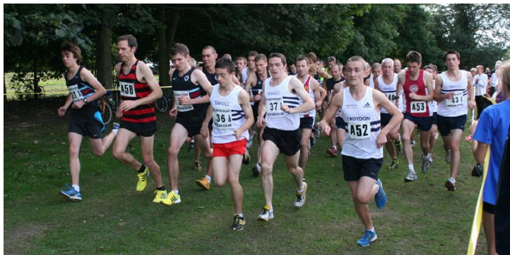
The season gets underway with the Cross-Country Relays. This is the first of the nine Bennett Cup counting races