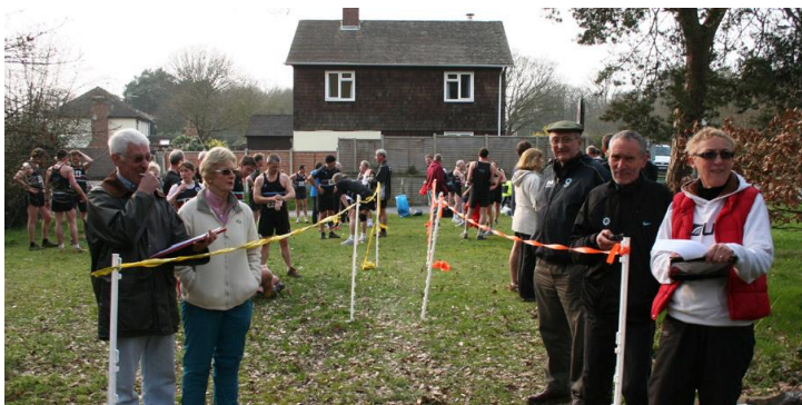
The C-C officials waiting for the last runner of the last race of last year...