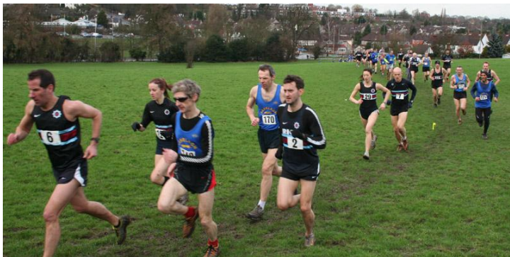
Last year's annual Mob Match against Ranelagh Harriers

Although the first inter-club race with Ranelagh Harriers was in 1886 it was not until 1907 that a match was run on an "all to score" or "mob match" basis. Subsequently it was agreed that the number to score would be that of the club with the smaller numerical strength, less three. This became established as the standard scoring method for all mob matches.