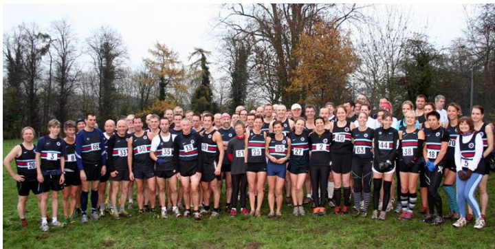
We also have Mob Matches against other clubs – the above was taken prior to the start of last year's Orion Match

Although the first inter-club race with Ranelagh Harriers was in 1886 it was not until 1907 that a match was run on an "all to score" or "mob match" basis. Subsequently it was agreed that the number to score would be that of the club with the smaller numerical strength, less three. This became established as the standard scoring method for all mob matches.